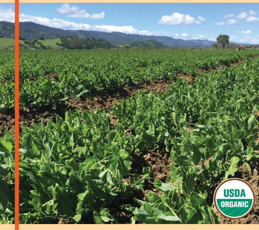
This organic farm grows food without the use of toxic pesticides.

Reduce your exposure to toxic pesticides and protect your health and the health of your family