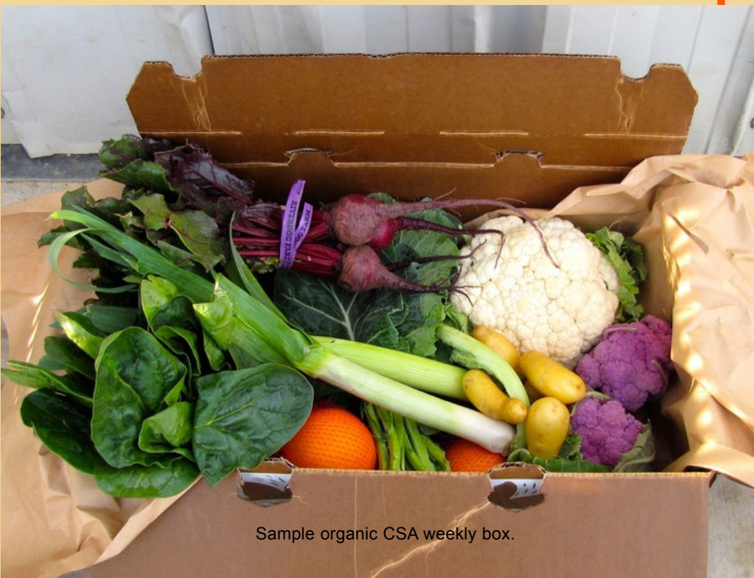
Sample organic CSA weekly box.