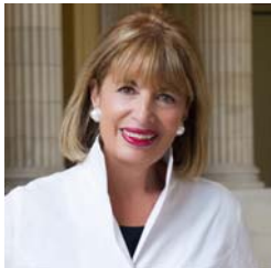
Congresswoman Jackie Speier