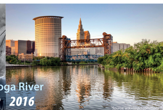
Cuyahoga River 1952 2016