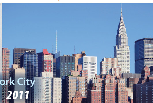
New York City 1970s 2011